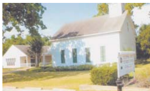
The Coldspring United Methodist is registered as a United Methodist Church Site. The church was founded in 1848 and the sanctuary built in 1858. It is located on State Highway 150 and Cemetery Road in downtown Coldspring.