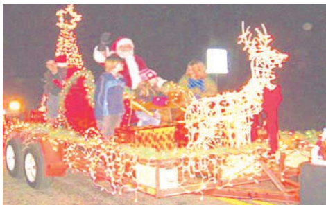
A lighted nighttime parade is an feature of Christmas on the Square.