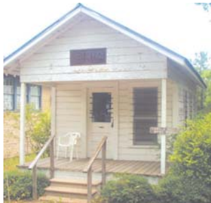
The historic Camilla Post Office once served the thriving town of Camilla, Texas in 1895. The building is now preserved in Old Town, Coldspring, at the Old Jail Museum.