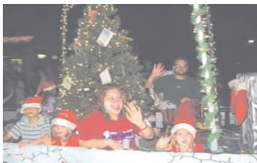
Christmas on the Square is held on the second Saturday of each December on the San Jacinto County Courthouse Square in Coldspring.