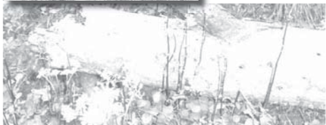
Heavily forested with abundant wildflowers, camp sites and trails make Double Lake in the Sam Houston National Forest a ideal recreational place to enjoy.