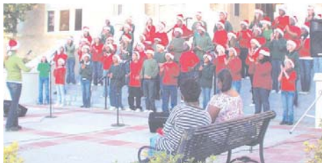
Christmas on the Square is hosted by the Coldspring/San Jacinto County Chamber of Commerce and includes entertainments throughout the day.