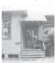
The Old Waverly School House is preserved in Old Town, Goldspring at the San Jacinto County Jail Museum. It once housed school for children at Waverly, Texas.