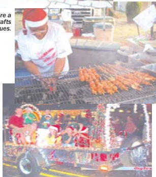
Among the features are a food court, arts and crafts vendors and antiques.